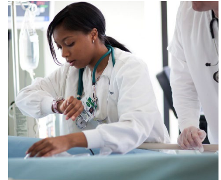
College of DuPage/Flickr 2013

To submit an NISF application, you must first have a KBN nurse portal account. You do not have to be a nurse to create an account. You must have a valid email address that you are able to access. To create your nurse portal account, go to the KBN Nurse Portal and click the blue Create an Account button. Follow the prompts for creating an account and you will receive an email with an activation link. Click on the activation link to finish the account creation process. More instructions on creating a nurse portal account, including an instructional video, can be found on the Nurse Portal Instructions