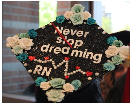
Rutgers School of Nursing Graduation 2016

You may also submit a Student Aid Report (SAR) if you wish financial need to be considered when your